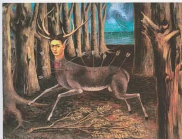
FIGURE 2. FRIDA KAHLO, The Little Deer , 1946. Oil on masonite. 8 7/8" x 11 3/4" (22.5 x 29.8 cm). Private collection. © 2010 Banco de México Diego Rivera y Frida Kahlo Museums Trust.

in recent decades, but nothing quite like the massive cache that emerged last year in Mexico. The “rediscovered” material includes more than 1,200 items — oil paintings, drawings, diaries, letters, painted boxes and ephemera. The owners characterize it as an archive assembled by Frida Kahlo, but the entire collection has been roundly rejected by the established authorities on the artist’s life and work, although other people have spoken out in favor.