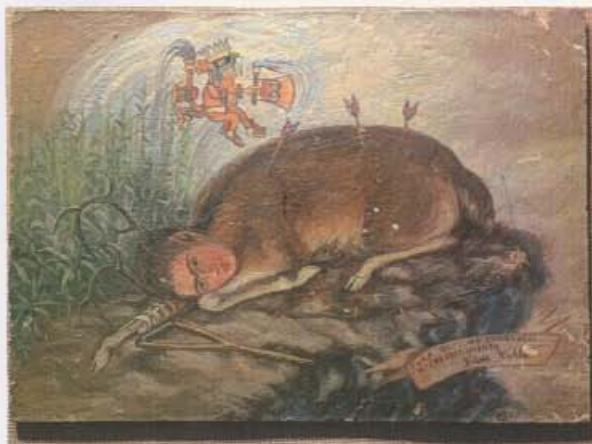
FIGURE 4. The Little Deer. Oil on Masonite. 24 x 33 cm. Noyola Collection. The attribution to Frida Kahlo is questioned.