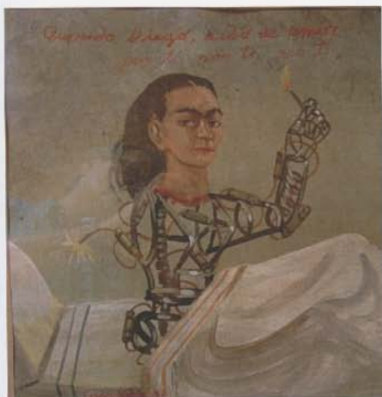
FIGURE 5. Woman with Firecrackers . Oil on cardboard. 35 x 31 cm. Noyola Collection. The attribution to Frida Kahlo is questioned.

Frida-headed deer (FIG. 4) — “is not Kahlo’s painting because the concept of the work as well as its execution were invented by someone who does not understand the depth of her iconography.”