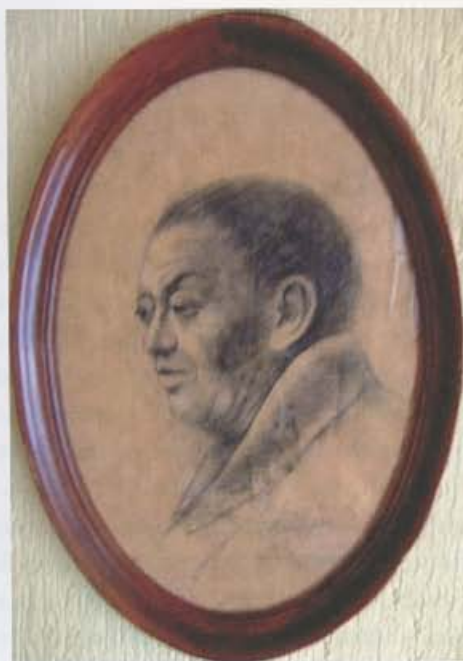
FIGURE 6. Drawing of Diego Rivera. Noyola Collection. Pencil on paper. 19 1/2” x 13 3/4” (50 x 35 cm). The attribution to Frida Kahlo is questioned.